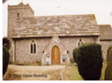
St Peter & War Memorial

Bethel Baptist (registered for worship 1837)