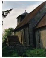
St Michael & War Memorial

Protestant Dissenters House (registered for worship 1814)