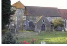
St Mary & War Memorial

Wesleyan Methodist (registered for worship 1829) Methodist (registered for worship 1882 closed 1960)