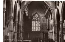
St Philip, New Church Road (registered for worship 1894)