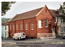
St Matthews, Bute Mission Sutherland Road