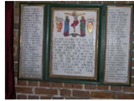
St Georges Chapel, St. Georges Rd. Kemp Town